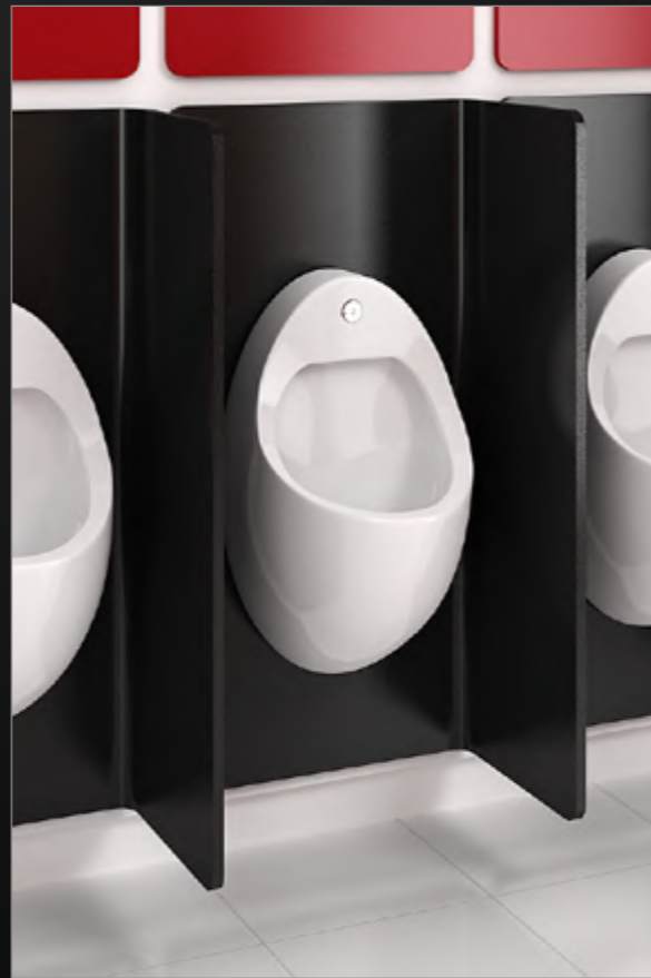
SIDEMINDER™ Using preformed solid grade laminate elements to form a curved urinal splashback and integrated side screen brings simple, clean looks to your washroom.