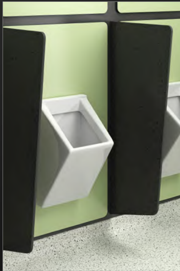
SAILAWAY™ The sail-shaped solid grade laminate urinal screen brings an attractive and unusual curved profile to the urinal area.